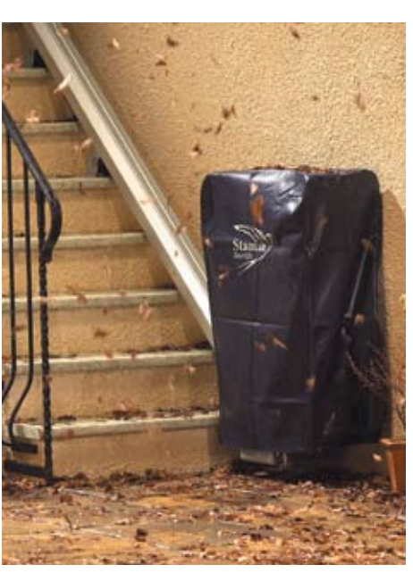
6. When not in use, the stairlift can be folded flat against the wall so the staircase can be used by others. A protective cover is also provided.