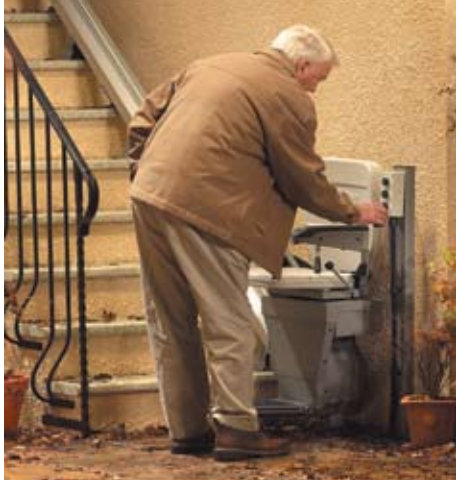
Optional call station