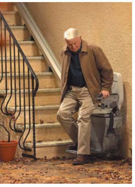
2. Once unfolded, make yourself comfortable on the seat. Use the safety belt for extra security if you choose.