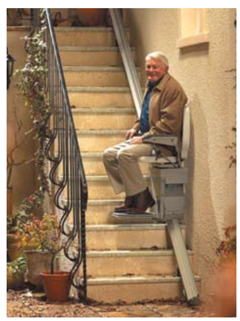
3. Gentle pressure on the directional controls positioned on the arm is all it takes to make your stairlift move smoothly up or down the stairs.