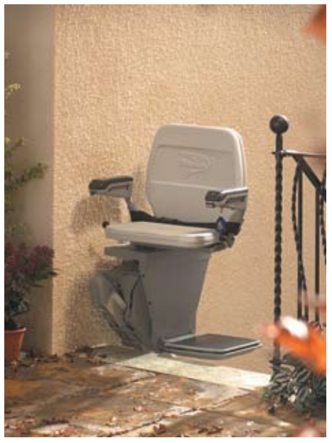
5. After dismounting, you can store the chair away by simply lifting up the arms, seat and footrest. Or, you can leave the chair in the swivel position so it acts as a safety barrier to prevent anyone falling down the stairs.