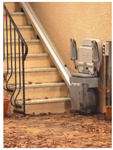
1. To use the Outdoor stairlift, unfold the footrest, the seat and the arms.