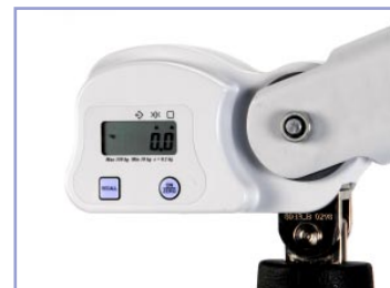
Digital weigh-scale (Class III certified)

5 The Stature was designed with the 5 key principles of moving and handling in mind. This direct correlation ensures Oxford's lift designs are simple, safe and above all comfortable to use.