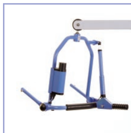
Manual or powered cradles