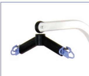
6-point spreader bar

The Stature is available with a number of key accessories, making it both versatile and flexible in use.