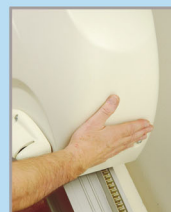
Carriage Safety Switches