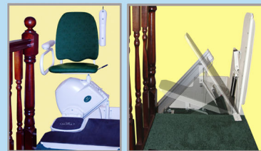
AUTOMATIC OR MANUAL BRIDGING PLATFORM

Where there are just a few steps in a short bend (or 'fan') at the head of the stairway there is the option of fitting a Manual Bridging Platform. Alternatively and for the ultimate in ease of use there is a Battery Powered Bridging Platform. This worry free and unique design allows the platform to automatically move into the operation (down) position as you ascend the stairs and then automatically fold away as you descend the stairs.