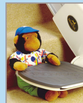
Pressure Sensitive Footrest

Where there are just a few steps in a short bend (or 'fan') at the head of the stairway there is the option of fitting a Manual Bridging Platform. Alternatively and for the ultimate in ease of use there is a Battery Powered Bridging Platform. This worry free and unique design allows the platform to automatically move into the operation (down) position as you ascend the stairs and then automatically fold away as you descend the stairs.