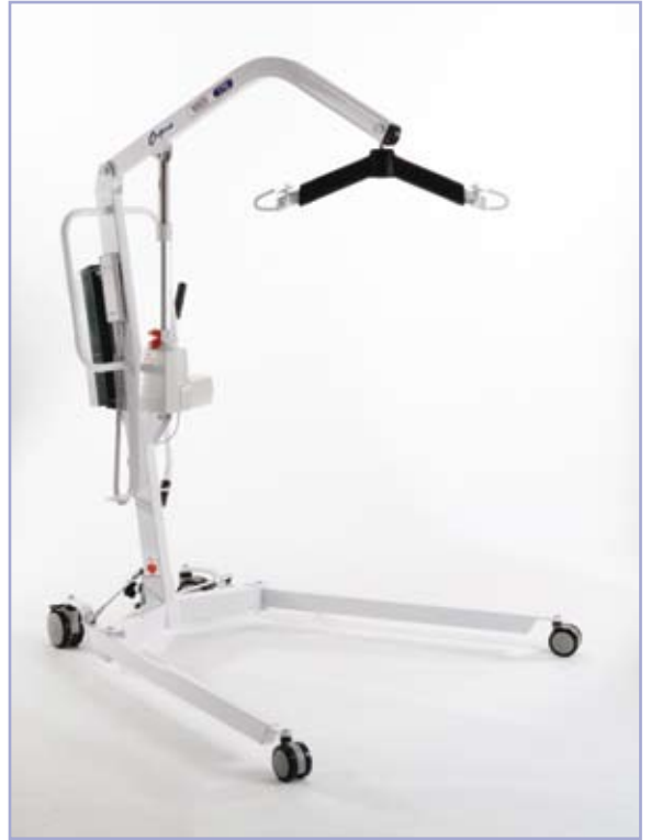
Midi 170 (170 kgs SWL)

The Oxford Midi 170 has become the versatile industry standard in homecare, offering surprising performance for a hoist of its size. The Oxford Midi offers the perfect solution for the community/nursing environment, whilst being sympathetic to the space constraints it may encounter. Available in both electric and hydraulic versions, the Midi is the all-round performer.