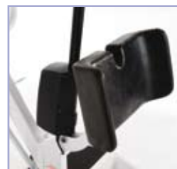
Large knee pad for added support