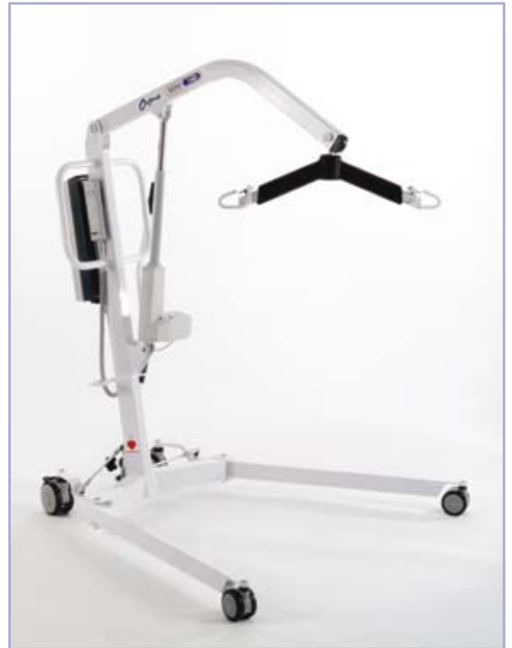
Mini 140 (140 kgs SWL)

The Mini and Stowaway are available in both electric and hydraulic versions.