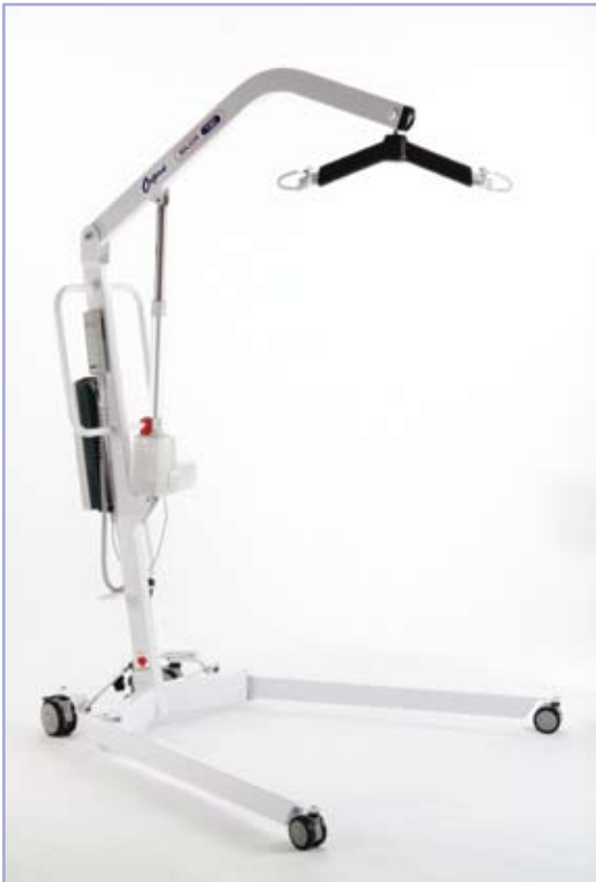
Major 190 (190 kgs SWL)