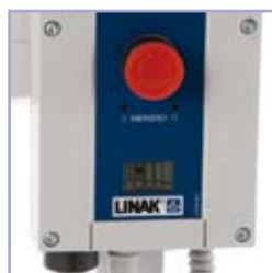
Control box with LCD display