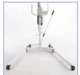
Legs open wide for stable and safe lift