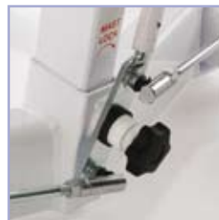
Leg opening device