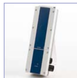
Off-board desktop charger