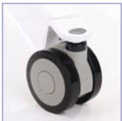
75mm low profile castors

The Oxford Major 190 is a true heavyweight contender and is the perfect cross over product for both nursing and institutional care. Its high lifting capacity (190 kgs) and lightweight design allow the Major to work well in almost all settings.