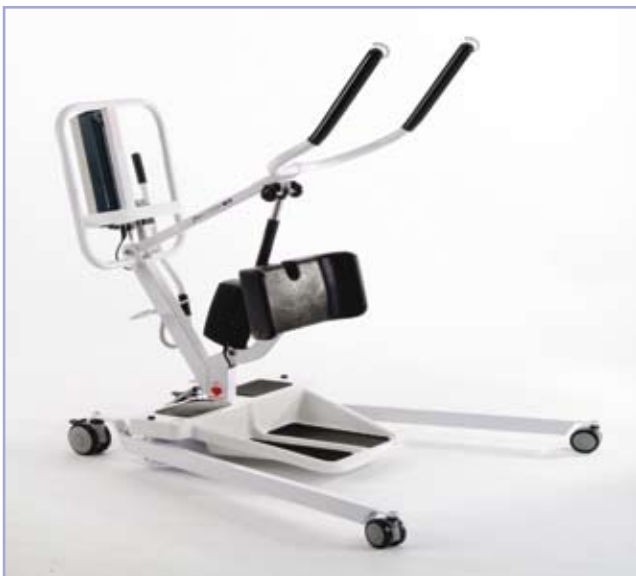
Standardaid 140 (140 kgs SWL)