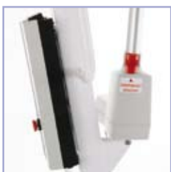
Linak battery & actuator