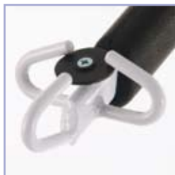
Sling attachment point