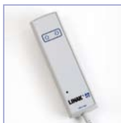
Easy to use hand control