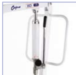
Hydraulic pump used on non-electric hoists