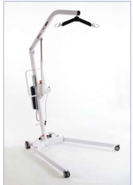
Maxi 170 (170 kgs SWL)

The Oxford Maxi 170 is exceptionally versatile and with a maximum lift height from the floor of almost 2 metres, the Maxi can handle almost any patient handling task. The Maxi can lift patients onto almost all institutional and nursing surfaces. Remarkably, the Maxi maintains a relatively compact frame allowing the hoist to be manoeuvred and stored with ease.