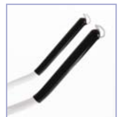
Cow horn handles ensure a safe and stable transfer