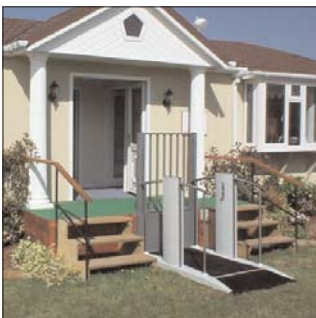
The 740 Standard model