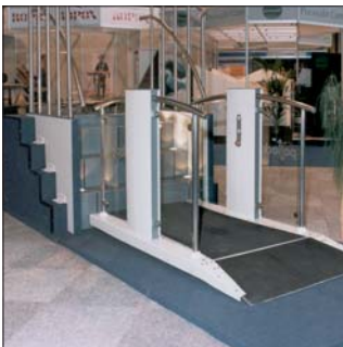
The Bridging Steps configuration