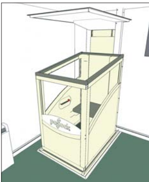
2. Exit the lift at first floor level