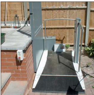
The Adjacent Entry configuration