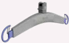
Infection Control Spreader bar