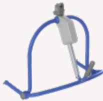
Medium & Large 4-point Powered Dynamic Positioning System