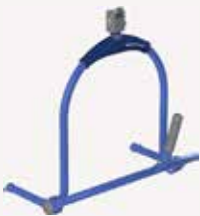
Manual 4-point Dynamic Positioning System